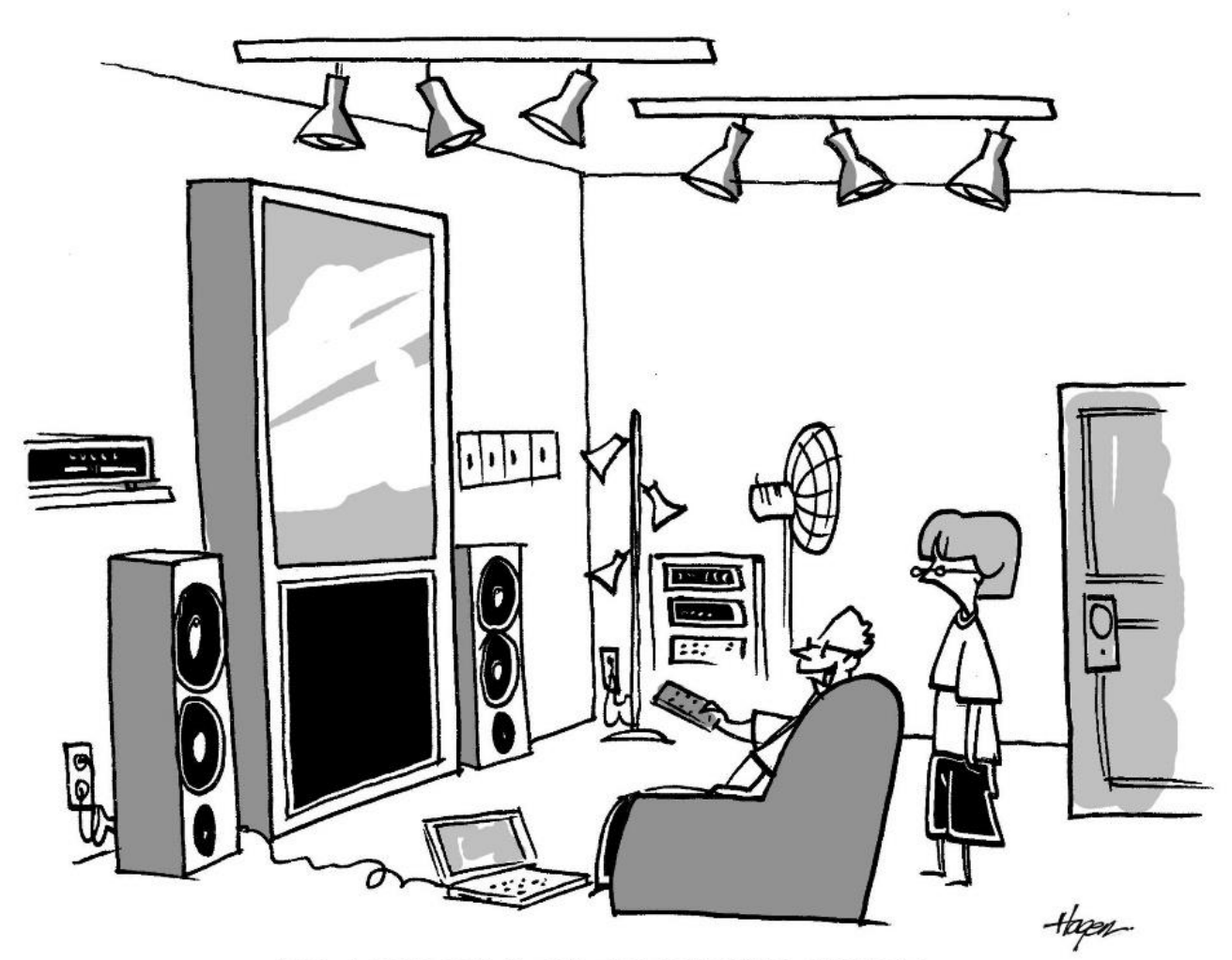
IT'S A PROGRAM ON CONSERVING ENERGY.