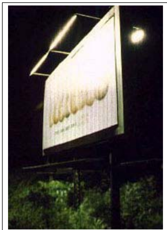
Figure 5: Experts in the field of light pollution recommend that signs be lit from the top so as to avoid projecting light into the atmosphere.

Botetourt County's effort at outdoor lighting regulation is presently the most sophisticated in the region. Botetourt County is one of seven counties in Virginia with outdoor lighting standards that aim not only to prevent glare and light trespass but also aim to limit atmospheric light pollution. The County's regulation of outdoor lighting includes many notable features. In the Zoning Ordinance, Botetourt County provides for full shielding for lights with outputs of greater than 2,000 lumens and for a 'light curfew', meaning that all outdoor lighting fixtures except those needed for security are to be turned off after close-of-business. In addition, the code directs those installing lights to ensure that the light is aimed no greater than 45 degree downward angle and that lights illuminating exterior signs are to mounted at the top of the sign so that less light is projected into the atmosphere (See Figure 5<sup>4</sup> for an illustration).