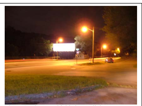
Figure 2: These unshielded streetlights present an example of fixtures causing glare at night.

In addition to the effects upon the ability to see stars caused by sky glow, light trespass, visual clutter, and glare are equally troublesome. Glare off of unshielded lights can present safety hazards to drivers or pedestrians walking through dark areas by adversely affecting Glare can be disabling if too powerful, causing motorized collisions. Figure 2 for an illustration of glare. Light trespass occurs when unwanted light shines on another's personal property or windows and is quite a nuisance in and of itself. Examples of light trespass might include light coming into one's bedroom window at night from streetlights, the nearby car dealer or mall, or