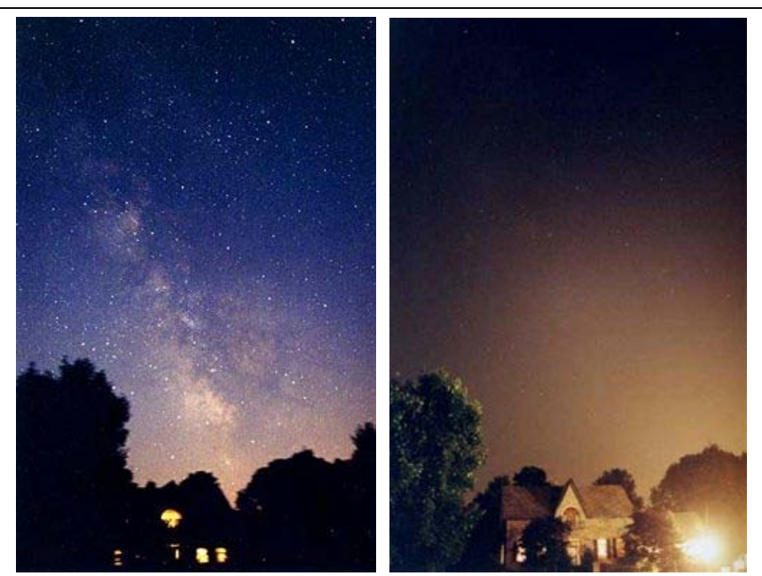
Figure 1: The first picture on the left was taken in Ontario, Canada during the Eastern North American Power Blackout of August, 2003. The second picture on the right was taken in the same location after power was restored.

What many may not realize is that the night sky that can be seen on Earth today is not the same view man had a mere century ago before electrification dotted the landscape with outdoor lighting fixtures. Very few areas remain where the view has not been subjected to degradation due to the effects of urban light pollution and sky glow. According theoretical models of light pollution, even remote areas many miles away from an urban area are affected by the sky glow produced in cities by light pollution.