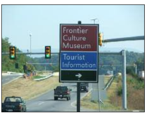
Figure 40-Wayfaring sign in the City of Staunton, VA