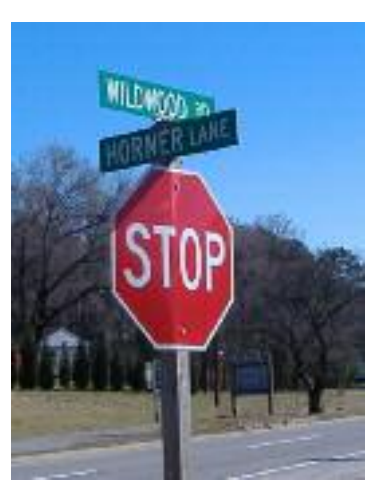
Figure 34-Street sign and stop sign on single post