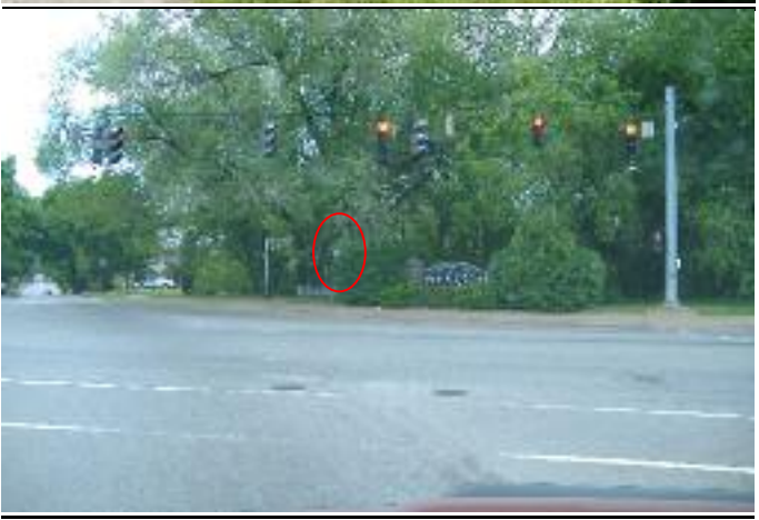
Figure 37-Route 11 route marker sign obscured by bush at the intersection of Brandon Avenue and Grandin Road.