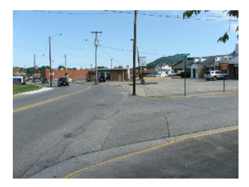
Figure 30-Another example of a sign placed in a poor location. The brown sign (on the right) should be placed closer to the through road on the left, and preferably before the turn.

There are also several instances of improper/incomplete stop sign placements in the Roanoke Valley. Figure 31 illustrates an example of a "T" intersection with incorrect stop sign placement. Adding to the potential confusion in the example below is the lack of a stop line on the pavement. While local drivers may be used to the traffic flow, visitors, inexperienced drivers or inattentive drivers may be looking in the wrong place for the stop sign. Figure 32 illustrates proper stop sign locations.