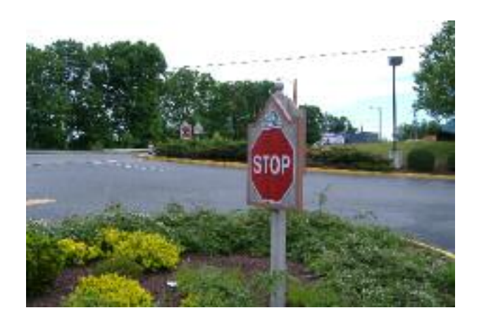
Figure 38-Signs on private property at Towers Mall. While not required to meet MUTCD standards, unless by local regulation, traffic control devices on private property have the potential to regulate the flow of thousands of vehicles a day.