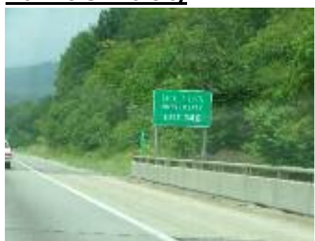
Figure 11-Hollins University I-81