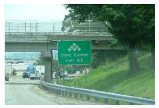
Figure 7- Roanoke Civic Center I-581

The Roanoke Civic Center uses a logo based sign system from I-581 (see Figure 7). Signs appear adequate and parking is accessible from both Williamson Road and Gainsboro Road. There are two signs at Exit 4 that only use the logo without text. Future signs should use the logo and text for clarification. Travelers may miss the