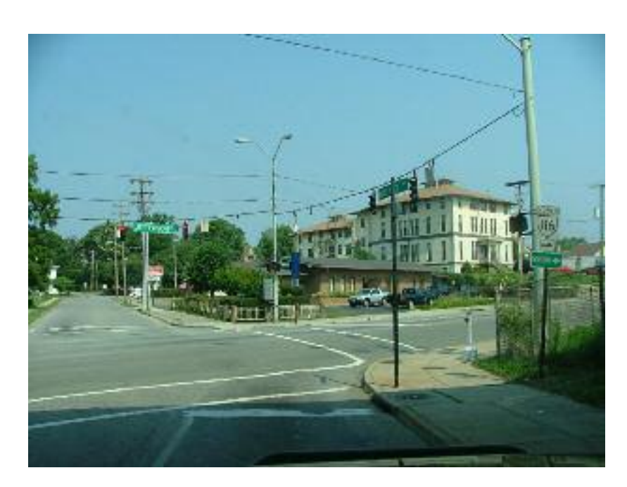
Figure 24-Intersection of Walnut Avenue with Jefferson Street. Signage exists to Sports Complex and downtown, but not to the other attractions in Figure 23. A similar signpost to Figure 23 should be added with a right turn arrow.