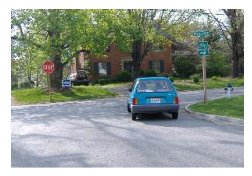
Figure 31-Improper stop sign location at "T" intersection. Regulatory signs should be placed in standard and expected locations.

There are also several instances of improper/incomplete stop sign placements in the Roanoke Valley. Figure 31 illustrates an example of a "T" intersection with incorrect stop sign placement. Adding to the potential confusion in the example below is the lack of a stop line on the pavement. While local drivers may be used to the traffic flow, visitors, inexperienced drivers or inattentive drivers may be looking in the wrong place for the stop sign. Figure 32 illustrates proper stop sign locations.