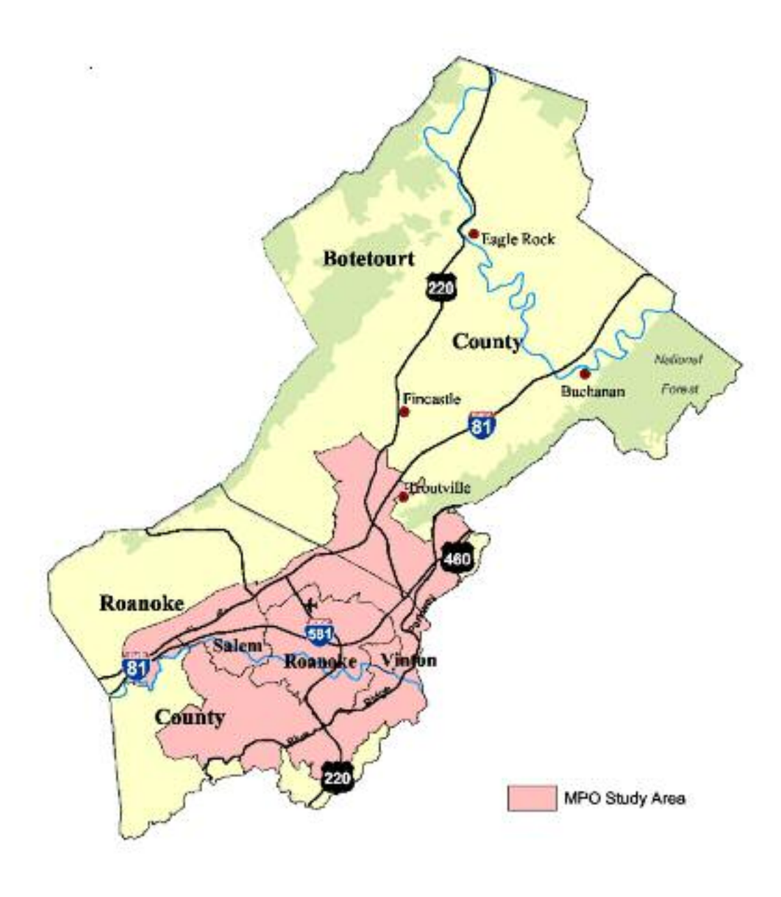
Map 1-Metropolitan Planning Organization Study Area