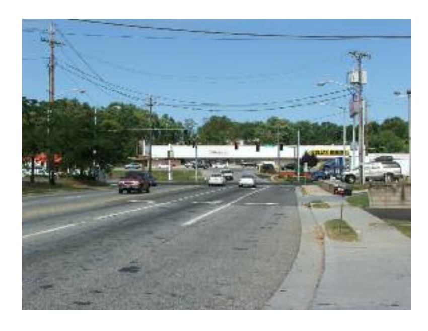
Figure 42-Travelers on Gus Nicks Boulevard may benefit by a US 460/221 and TO-81 signpost.

Finally, in regard to route markers, Gus Nicks Boulevard in the City of Roanoke is a popular route between Vinton, Route 24 and US460 (Orange Avenue). A route signboard on Gus Nicks Boulevard should show the US460/221 intersection and possible include a "TO I-81" sign (Figure 42)