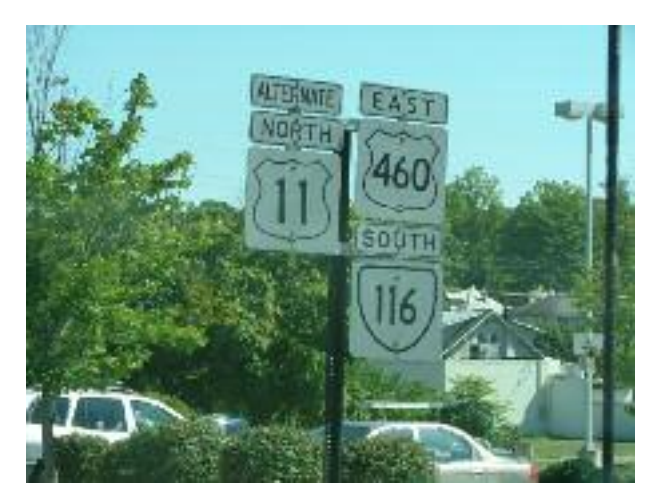
Figure 39-Older route markers on white background

Staff reviewed several of the primary corridors in the Roanoke Valley. These corridors included US 11, US 220, US 460, US 221, Route 311, Route 419 and Route 24. Many of these routes use an older style route marker, as pictured in Figure 39. These route markers are harder to see than the newer style signs that are on a black background. The older style signs also appear to be slighly smaller in scale.