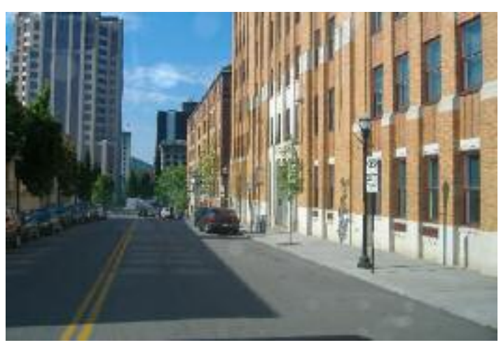
Figure 10-Higher Education Center

The Roanoke Higher Education Center is signed from I-581 for Exit 4E northbound and Exit 5 southbound. Currently, no sign exists at the end of the Interstate ramp and the intersection of Wells Avenue, and this should be corrected. Local signage is provided by Roanoke City's