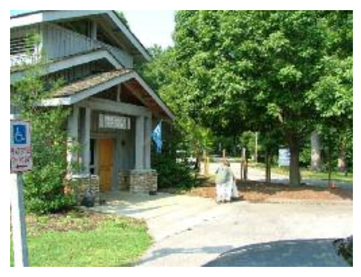
Figure 21-Discovery Center (left) and pathway to zoo (on right)

When visitors park at the Zoo, it is not very clear where to buy tickets or access the zoo. According to City of Roanoke Parks staff, many zoo visitors enter the "Discovery Center" to buy tickets, but the center is not associated with the zoo. This issue should be examined and resolved by better pedestrian signage or relocation of the zoo ticket office. The directions on the Zoo's website are also incorrect.