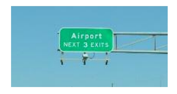
Figure 6- should read "NEXT 2 EXITS"