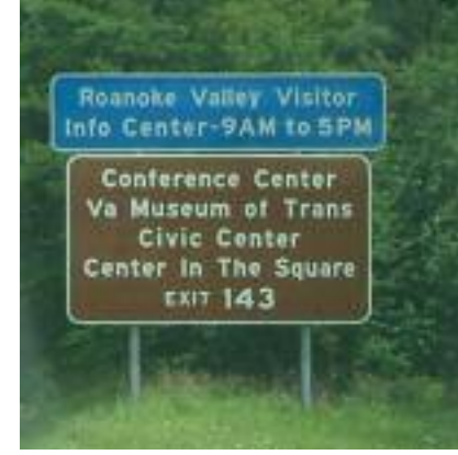
Figure 8-"Civic Center" I-81 South

civic center and the logo by itself is not intuitive. The local civic center signage will likely be part of the City's wayfaring system. The Civic Center is also signed from I-81. However, the I-81 signs do not specifically say "Roanoke Civic Center". There is a slight potential of confusion between the Roanoke and Salem Civic Centers, especially with I-81 south, since both exit 143 and 141 are Civic Center exits, but to different Civic Centers.