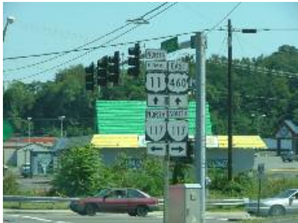
Figure 40-Newer route markers on black background

While most routes are easy to follow, there are two potential problem areas. US 11A/US460 switches from Melrose Avenue to Orange Avenue in the City of Roanoke. The westbound signs are visible in the center of Figure 41.