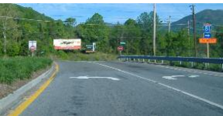
Figure 20-No sign at intersection with US11/460 indicating whether to turn left or right to get to the State Police Division Headquarters.