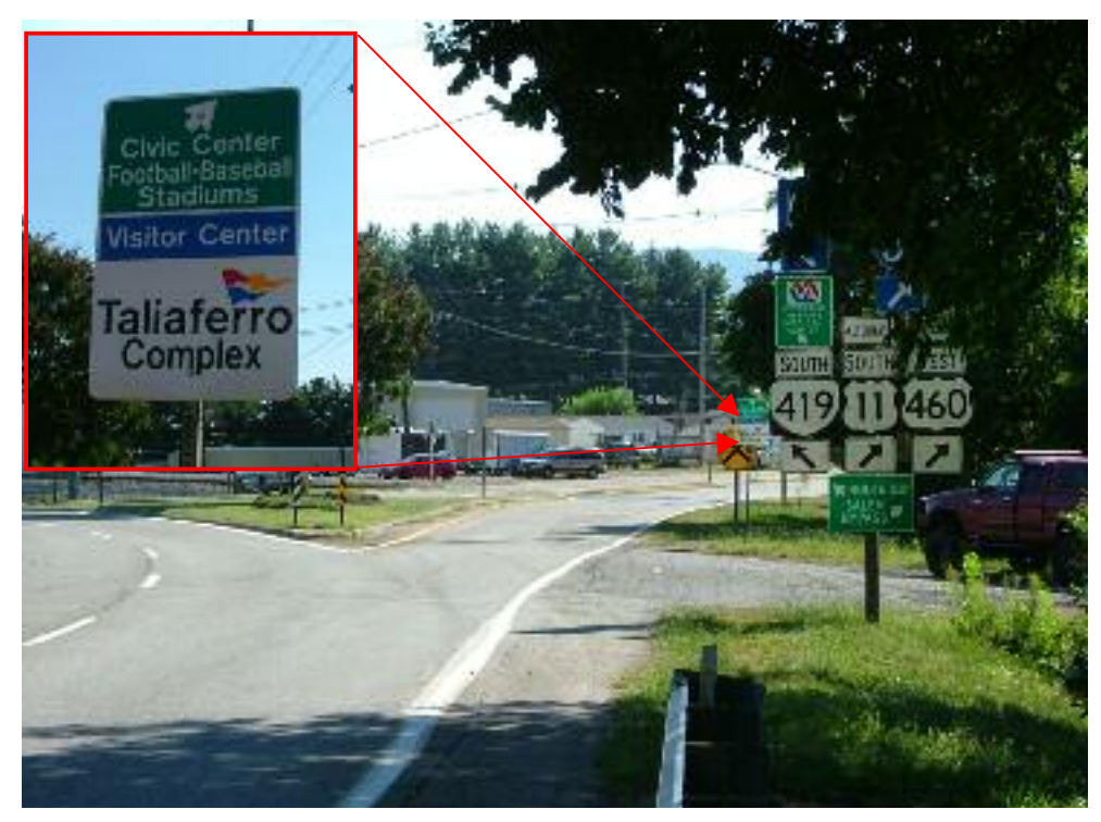
Figure 9-Salem Civic Center signage on Electric Road/Texas Street

Finally, the directions on the Salem Civic Center website have the wrong directions since some stoplights have been added at the Exit 141 interchange.