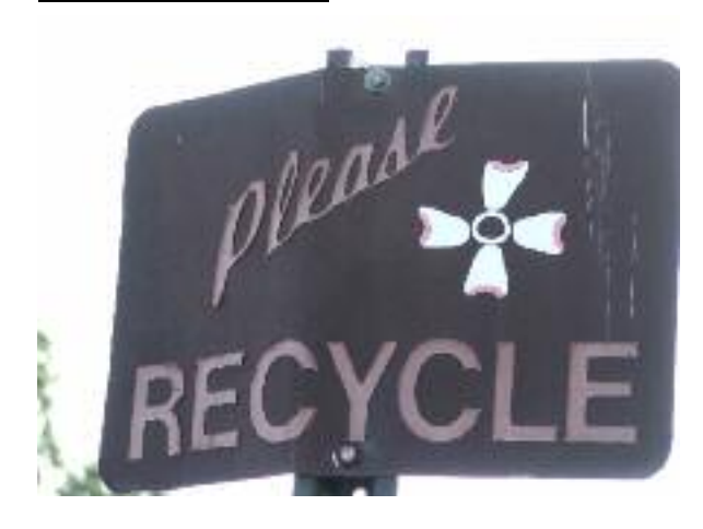
Figure 35-Rusty educational sign in urban area.

Figure 35 illustrates an unnecessary sign that is in poor condition. Signs should serve a specific purpose; provide information, regulate traffic, warnings. provide While educational signs can serve a useful purpose, they are not advised for urban traffic conditions that already have many distractions. These signs types of also require maintenance resources which must be considered.