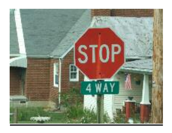
Figure 26-Mis-matched sign colors. All regulatory signage should meet MUTCD color criteria.

The MUTCD standards provide clear guidelines on the use of color in sign design. While local governments may have limited resources, compromises should not be made on regulatory signs that may affect road safety.