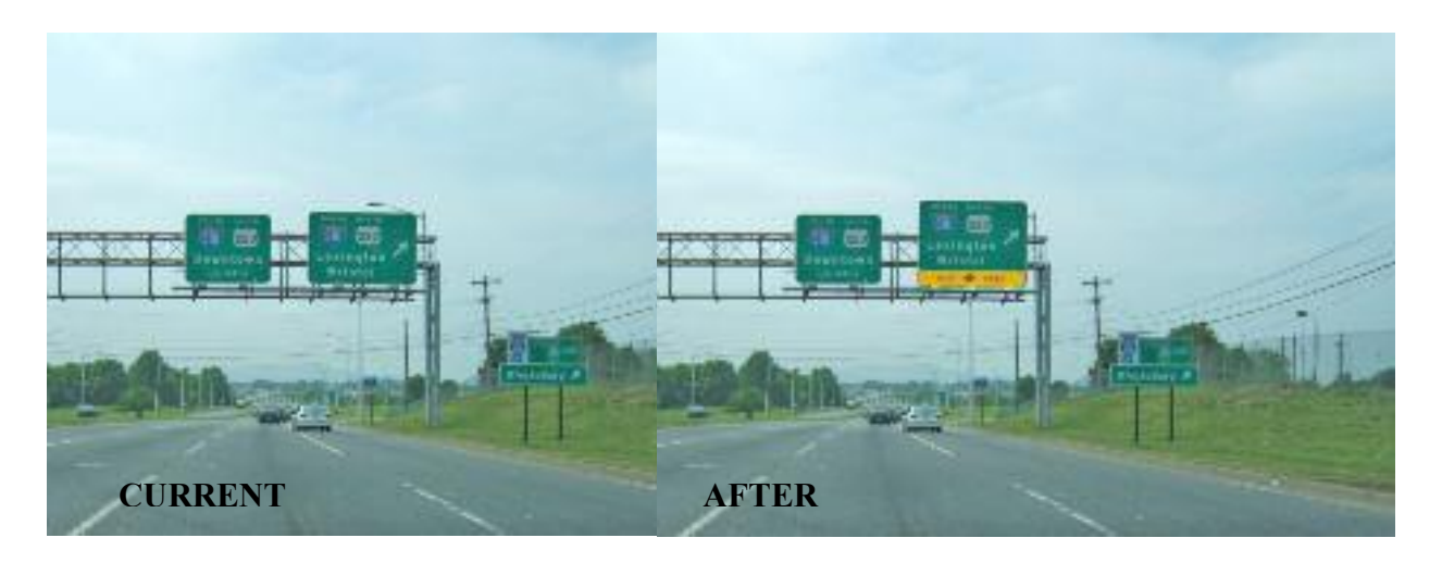
Figure 38-Hershberger Road exit only lane to I-581 north could benefit by better marking on an overhead sign or on the pavement

A common complaint amoung area residents is that the right lane in Figure 38 is an on-ramp to I-581. Local traffic often has to merge left at the last minute when they realize the lane ends. This situation could be improved by an "EXIT ONLY" sign on the overhead, or by pavement markings with a similar message.