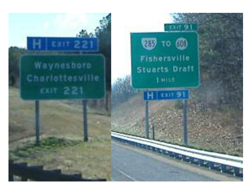
Figure 16-Hospital signs on I-81 and I-64 near Fishersville clearly indicate the Exit number for the Augusta County Medical Center. Signs in the Roanoke Valley could be updated to such standards.

After staff consulted with VDOT officials, the signs were modified by adding a small "next right" or "next left" sign under the "H". Other areas of the state use even clearer markings such as Figure 16. When the Community Hospital closes in downtown Roanoke. Lewis Gale Hospital probably be the closest hospital to serve the I-81 corridor. It is recommended that travel times be reviewed and that hospital signs be removed from Exit 143 ,if appropriate.