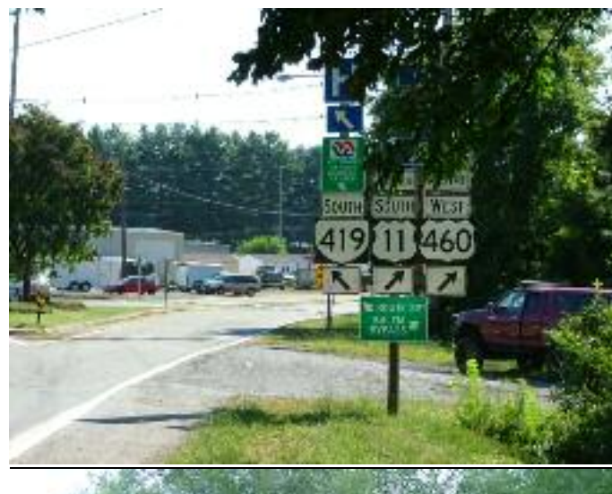
Figure 36-Signs obscured by vegetation

Vegetation sometimes obscures signs as in Figures 36 and 37. While requiring extra resources, efforts should be made to keep signs, especially regulatory signs, visible.