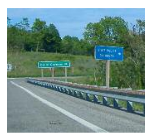
Figure 19-Clear directions on Interstate 81 north and Exit 132 ramp for the State Police Division Headquarters

On northbound Interstate 81, the State Police Division Headquarters has a sign for Exit 132. On southbound Interstate 81 the office can be found via Exit 137. Figure 19 shows clear directions from the northbound exit ramp at Exit 132. However, the driver reaches the intersection with US11/460 and has no indication whether to turn left or right (see Figure 20). Since this has possible safety implications (someone needing police assistance), a sign at the intersection of Dow Hollow Road and US/11/460 should indicate that a left turn is required. Since the office is several miles away, a distance measure may also be of value.