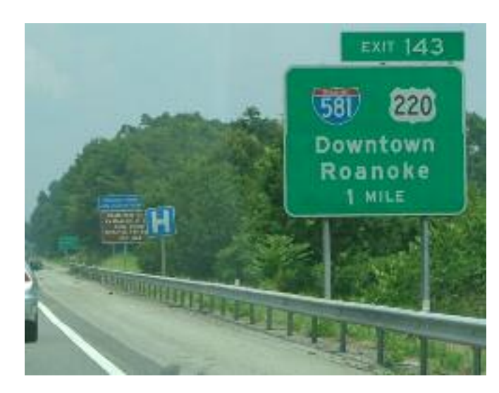
Figure 15- Lone hospital signs on I-81

The hospital has signs on I-81 for Exit 143 and I-581 for Exit 6. When the fieldwork for this study was first conducted, the signs on I-81 were on signposts by themselves. No exit information was given and it was unclear if the signs meant hospital ahead or take the next exit (see Figure 15).