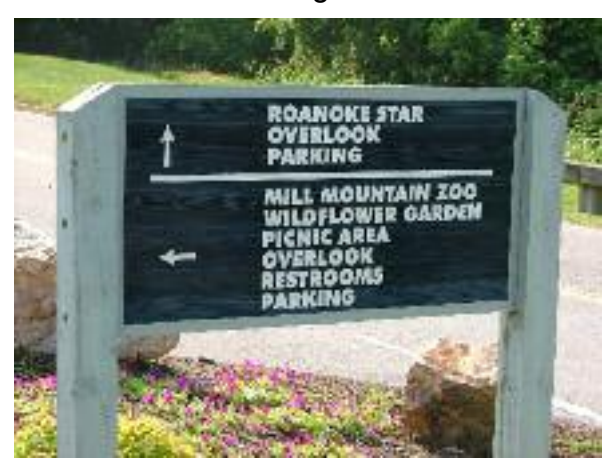
Figure 22-Mill Mountain destinations are clearly marked, expect for the "Regional Information Center".

A "Regional Information Center" is signed from the Parkway and on the Mill Mountain Spur, but there is no signage on Mill Mountain. The Information Center is in the "Discovery Center", but visitors have no way to know this since it is not marked. Additional signs should be added.