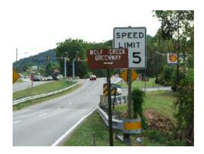
Figure 29-A series of five signs that are placed in a single line of sight. Such conflicts should be avoided through better sign placements.