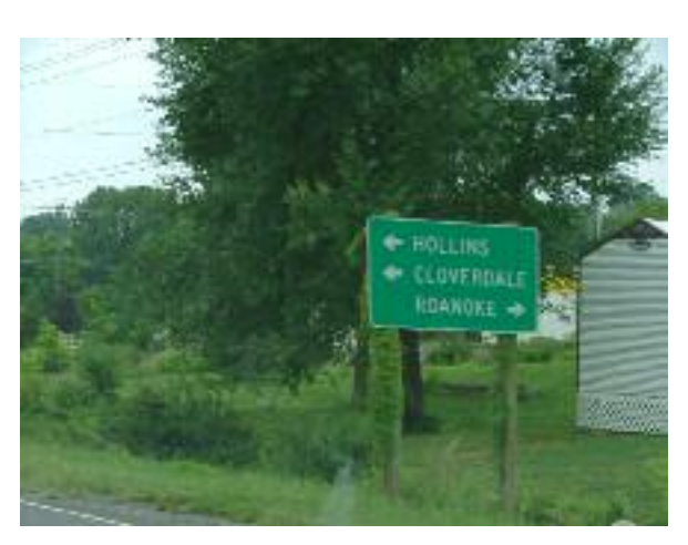
Figure 12-"Hollins" at Plantation/US 11

Hollins University has signs on both northbound and southbound I-81 at Exit 146 (see Figure 11). The exit ramps have appropriate signs to direct drivers to turn south on Plantation Road. As drivers approach Williamson Route (US 11) on Plantation, there is no official sign to direct people to turn left on US 11. The preceding signs to Hollins University used a special font, however, the sign at US 11 uses a standard font, and refers to Hollins as a place (town), rather than the University (see Figure 12). First-time visitors may continue on Plantation because of the lack of clear signage that the University requires a left turn on US 11. It is recommended that a matching "Hollins University" sign be placed at the intersection of Plantation and Williamson to indicate the left turn. The sign could be placed on or near the signboard in Figure 12.