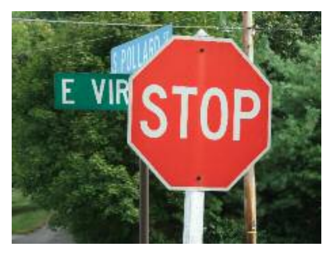
Figure 33-Street sign and stop sign on separate posts. Street sign obscured.

Most localties in the Roanoke Valley maintain their own street signs. In many cases these signs are placed at intersections, in proximity to stop signs. In urban localties, the stop signs are maintained locally, while the county stop signs are usually maintained by VDOT. There should be an attempt to locate street signs and stop signs on the same post when feasible. The co-location of signs saves resources and reduces sign clutter. Better coordination and policies could allow for more co-locations.