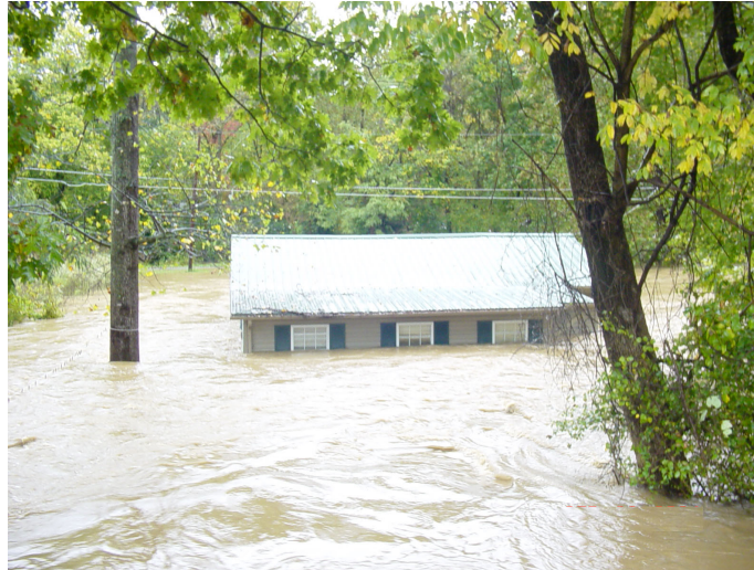
Flooded home in Roanoke County

Posted on September 6, 2018 at 1:04 PM by Bailey DuBois