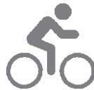
Pedestrian and Bicyclist Survey