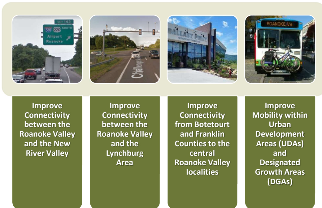
Figure 3 Roanoke Regional Transportation Priorities

Each of these needs can be addressed through a variety of strategies, identified based on existing regional planning as well as specific suggestions from the project steering committee. Furthermore, specific implementation proposals for the identified strategies were collected in the form of “projects” or “studies.” These represent incremental actionable items that address the overall RVTPO priorities. The fourth section of this report, “Roanoke Region Transportation Priorities for Economic Development and Growth,” provides full detail on proposed strategies and projects. The RVTPO and its planning partners are committed to advancing these as part of ongoing regional prioritization. The outcome of this study, therefore, is a “living document” with needs, solutions, and individual projects to be further refined on an ongoing basis as part of the RVTPO’s planning process.