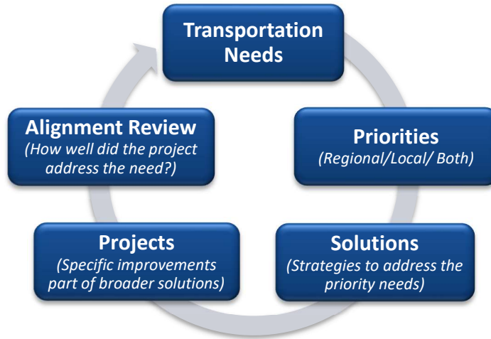
Figure 1 RVTPPO Framework for Prioritization