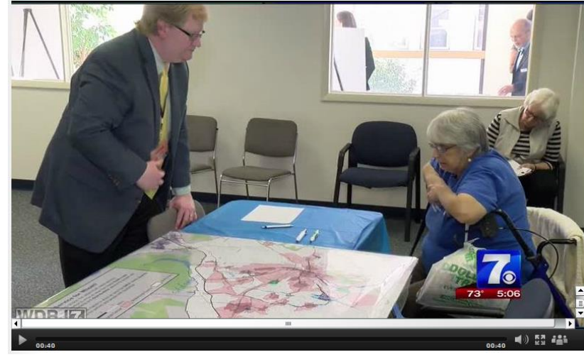
Planners say they need your input to shape the transit services we'll see in the future.