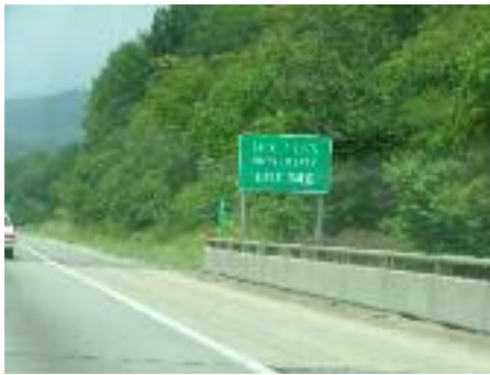
Figure 11-Hollins University I-81