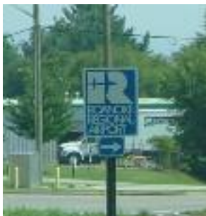
Figure 5-Airport Sign

The signage to Roanoke Regional Airport is very good. There are multiple locations throughout the Roanoke Valley that give direction and distance markings to the airport (see Figure 5).