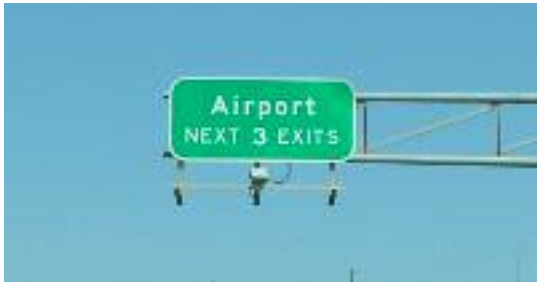
Figure 6- should read “NEXT 2 EXITS”