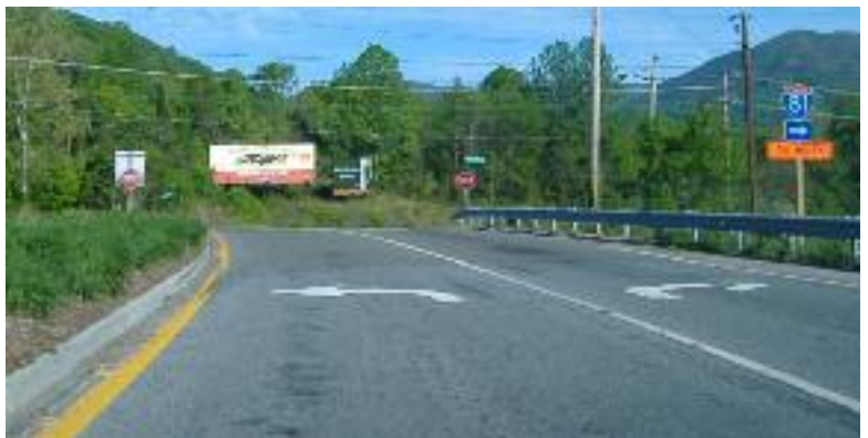
Figure 20-No sign at intersection with US11/460 indicating whether to turn left or right to get to the State Police Division Headquarters.