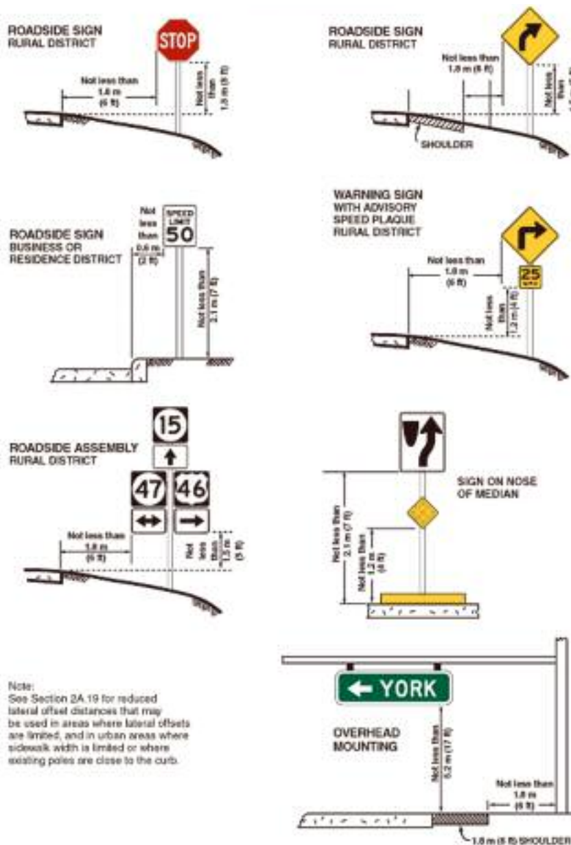
Figure 27 Examples of Heights and Lateral Locations of Signs for Typical Installations