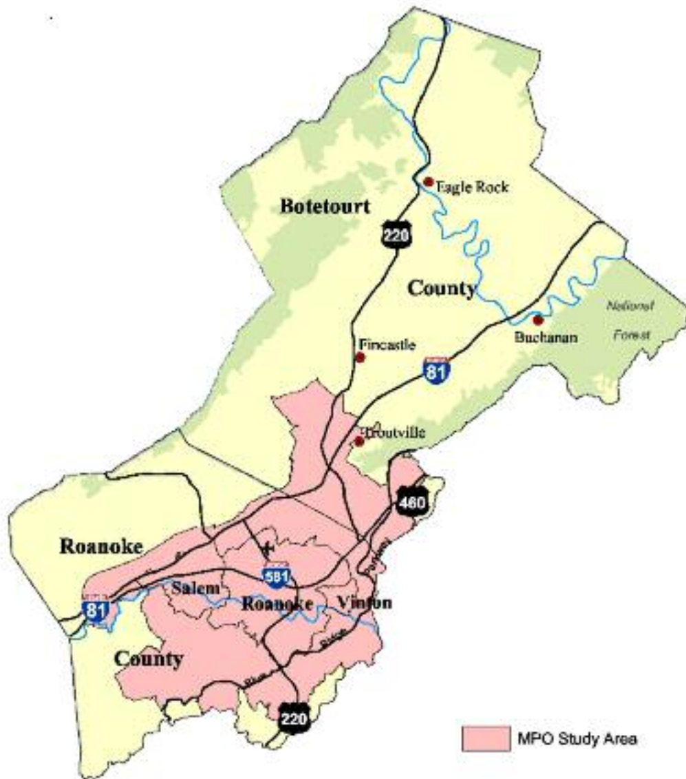
Map 1-Metropolitan Planning Organization Study Area