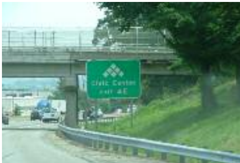
Figure 7- Roanoke Civic Center I-581

The Roanoke Civic Center uses a logo based sign system from I-581 (see Figure 7). Signs appear adequate and parking is accessible from both Williamson Road and Gainsboro Road. There are two signs at Exit 4 that only use the logo without text. Future signs should use the logo and text for clarification. Travelers may miss the first sign that associates the logo with the civic center and the logo by itself is not intuitive. The local civic center signage will likely be part of the City's wayfinding system. The Civic Center is also signed from I-81. However, the I-81 signs do not specifically say "Roanoke Civic Center". There is a slight potential of confusion between the Roanoke and Salem Civic Centers, especially with I-81 south, since both exit 143 and 141 are Civic Center exits, but to different Civic Centers.