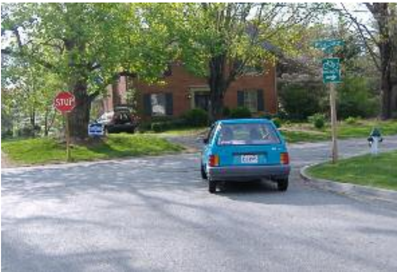
Figure 31-Improper stop sign location at “T” intersection. Regulatory signs should be placed in standard and expected locations.

There are also several instances of improper/incomplete stop sign placements in the Roanoke Valley. Figure 31 illustrates an example of a “T” intersection with incorrect stop sign placement. Adding to the potential confusion in the example below is the lack of a stop line on the pavement. While local drivers may be used to the traffic flow, visitors, inexperienced drivers or inattentive drivers may be looking in the wrong place for the stop sign. Figure 32 illustrates proper stop sign locations.