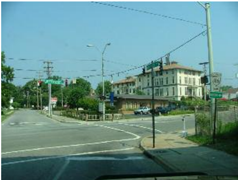
Figure 24-Intersection of Walnut Avenue with Jefferson Street. Signage exists to Sports Complex and downtown, but not to the other attractions in Figure 23. A similar signpost to Figure 23 should be added with a right turn arrow.