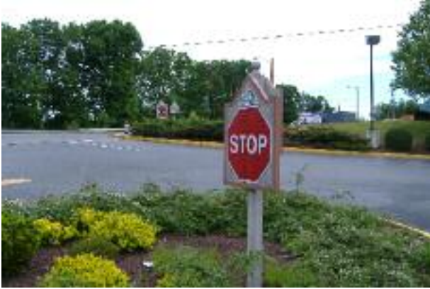
Figure 38-Signs on private property at Towers Mall. While not required to meet MUTCD standards, unless by local regulation, traffic control devices on private property have the potential to regulate the flow of thousands of vehicles a day.