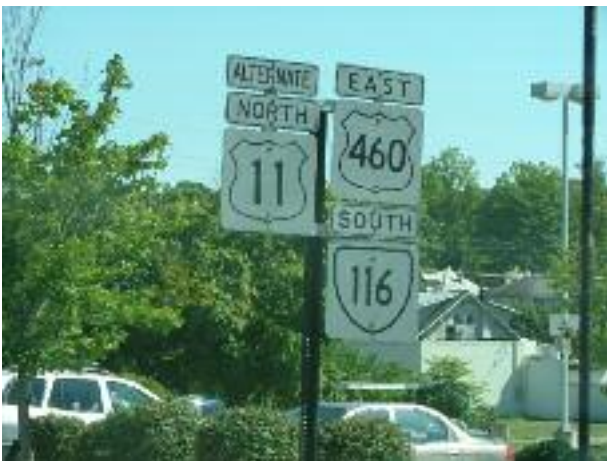
Figure 39-Older route markers on white background

Staff reviewed several of the primary corridors in the Roanoke Valley. These corridors included US 11, US 220, US 460, US 221, Route 311, Route 419 and Route 24. Many of these routes use an older style route marker, as pictured in Figure 39. These route markers are harder to see than the newer style signs that are on a black background. The older style signs also appear to be slightly smaller in scale.