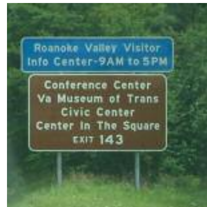
Figure 8- "Civic Center" I-81 South

The Roanoke Civic Center uses a logo based sign system from I-581 (see Figure 7). Signs appear adequate and parking is accessible from both Williamson Road and Gainsboro Road. There are two signs at Exit 4 that only use the logo without text. Future signs should use the logo and text for clarification. Travelers may miss the first sign that associates the logo with the civic center and the logo by itself is not intuitive. The local civic center signage will likely be part of the City's wayfinding system. The Civic Center is also signed from I-81. However, the I-81 signs do not specifically say "Roanoke Civic Center". There is a slight potential of confusion between the Roanoke and Salem Civic Centers, especially with I-81 south, since both exit 143 and 141 are Civic Center exits, but to different Civic Centers.