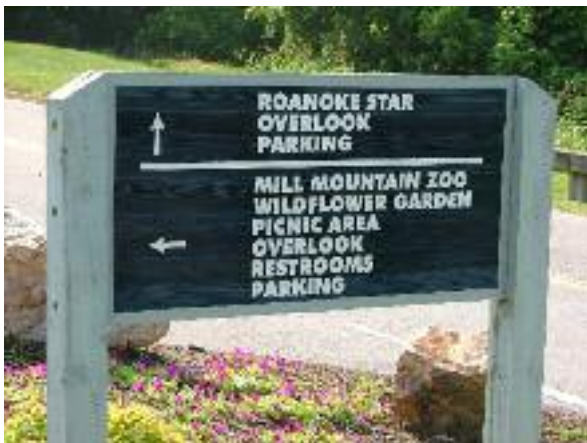
Figure 22-Mill Mountain destinations are clearly marked, except for the “Regional Information Center”.

A “Regional Information Center” is signed from the Parkway and on the Mill Mountain Spur, but there is no signage on Mill Mountain. The Information Center is in the “Discovery Center”, but visitors have no way to know this since it is not marked. Additional signs should be added.