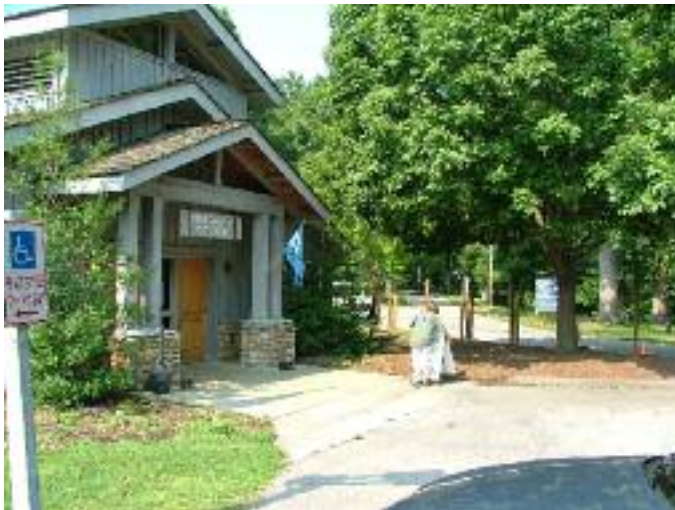
Figure 21-Discovery Center (left) and pathway to zoo (on right)

When visitors park at the Zoo, it is not very clear where to buy tickets or access the zoo. According to City of Roanoke Parks staff, many zoo visitors enter the “Discovery Center” to buy tickets, but the center is not associated with the zoo. This issue should be examined and resolved by better pedestrian signage or relocation of the zoo ticket office. The directions on the Zoo’s website are also incorrect.