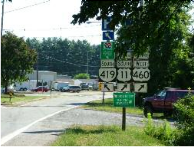
Figure 36-Signs obscured by vegetation

Vegetation sometimes obscures signs as in Figures 36 and 37. While requiring extra resources, efforts should be made to keep signs, especially regulatory signs, visible.