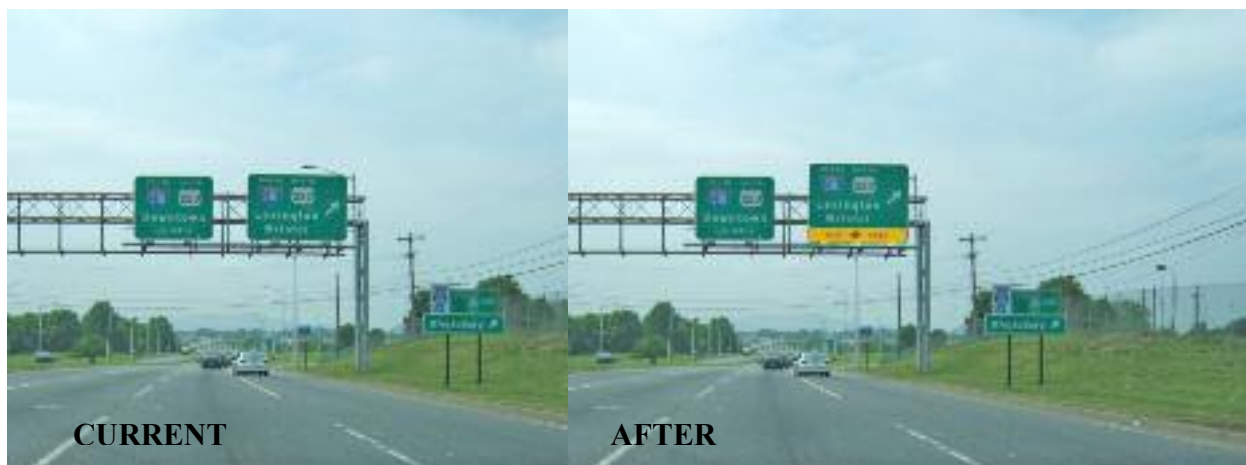
Figure 38-Hershberger Road exit only lane to I-581 north could benefit by better marking on an overhead sign or on the pavement

A common complaint among area residents is that the right lane in Figure 38 is an on-ramp to I-581. Local traffic often has to merge left at the last minute when they realize the lane ends. This situation could be improved by an "EXIT ONLY" sign on the overhead, or by pavement markings with a similar message.