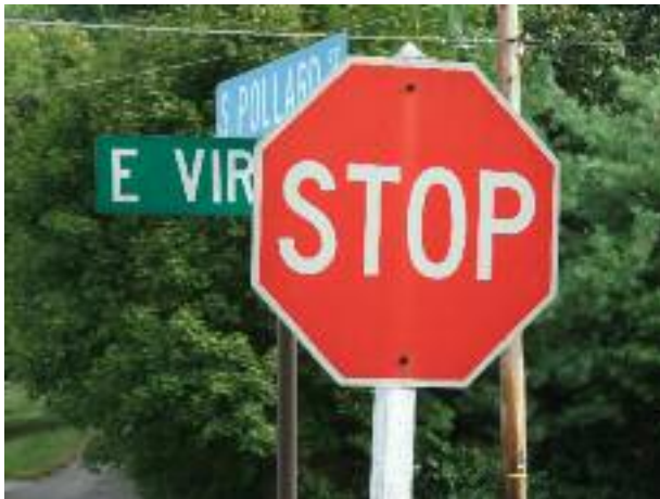
Figure 33-Street sign and stop sign on separate posts. Street sign obscured.

Most localities in the Roanoke Valley maintain their own street signs. In many cases these signs are placed at intersections, in proximity to stop signs. In urban localities, the stop signs are maintained locally, while the county stop signs are usually maintained by VDOT. There should be an attempt to locate street signs and stop signs on the same post when feasible. The co-location of signs saves resources and reduces sign clutter. Better coordination and policies could allow for more co-locations.