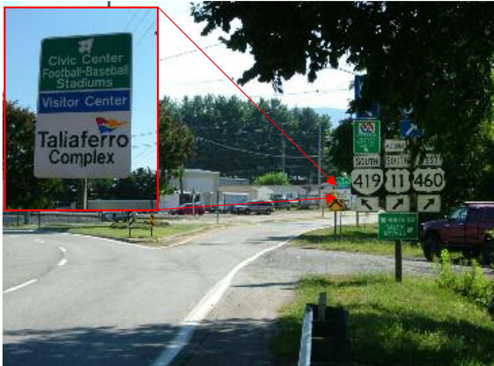
Figure 9-Salem Civic Center signage on Electric Road/Texas Street

Finally, the directions on the Salem Civic Center website have the wrong directions since some stoplights have been added at the Exit 141 interchange.