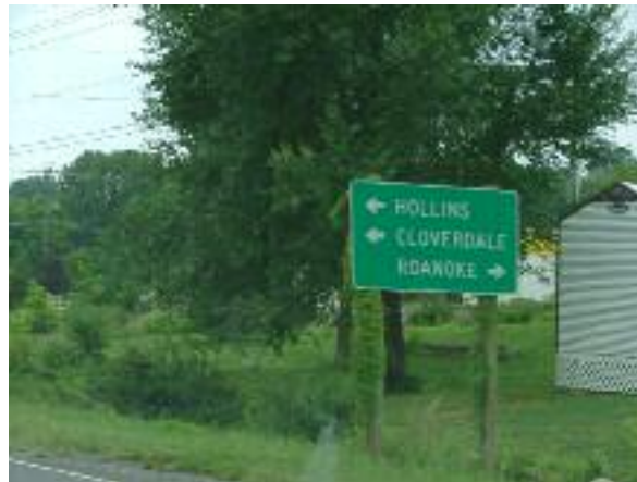
Figure 12-“Hollins” at Plantation/US 11

Hollins University has signs on both northbound and southbound I-81 at Exit 146 (see Figure 11). The exit ramps have appropriate signs to direct drivers to turn south on Plantation Road. As drivers approach Williamson Route (US 11) on Plantation, there is no official sign to direct people to turn left on US 11. The preceding signs to Hollins University used a special font, however, the sign at US 11 uses a standard font, and refers to Hollins as a place (town), rather than the University (see Figure 12). First-time visitors may continue on Plantation because of the lack of clear signage that the University requires a left turn on US 11. It is recommended that a matching “Hollins University” sign be placed at the intersection of Plantation and Williamson to indicate the left turn. The sign could be placed on or near the signboard in Figure 12.