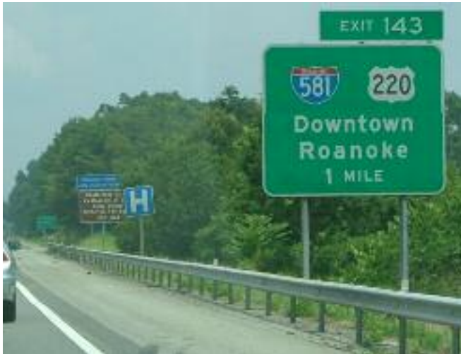
Figure 15- Lone hospital signs on I-81

The hospital has signs on I-81 for Exit 143 and I-581 for Exit 6. When the fieldwork for this study was first conducted, the signs on I-81 were on signposts by themselves. No exit information was given and it was unclear if the signs meant hospital ahead or take the next exit (see Figure 15).