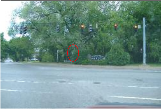
Figure 37-Route 11 route marker sign obscured by bush at the intersection of Brandon Avenue and Grandin Road.