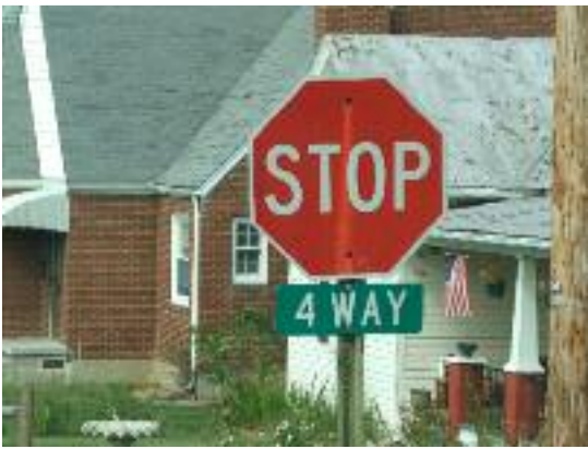
Figure 26-Mis-matched sign colors. All regulatory signage should meet MUTCD color criteria.

The MUTCD standards provide clear guidelines on the use of color in sign design. While local governments may have limited resources, compromises should not be made on regulatory signs that may affect road safety.