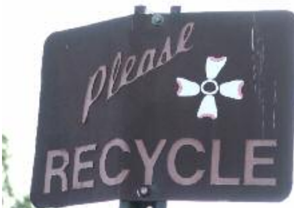
Figure 35-Rusty educational sign in urban area.

Figure 35 illustrates an unnecessary sign that is in poor condition. Signs should serve a specific purpose; provide information, regulate traffic, or provide warnings. While educational signs can serve a useful purpose, they are not advised for urban traffic conditions that already have many distractions. These types of signs also require maintenance resources which must be considered.