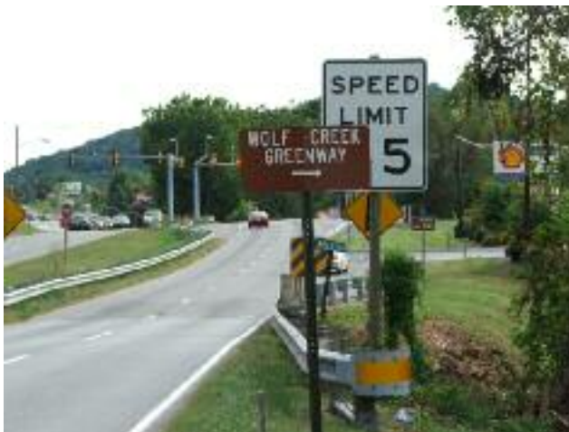
Figure 29-A series of five signs that are placed in a single line of sight. Such conflicts should be avoided through better sign placements.