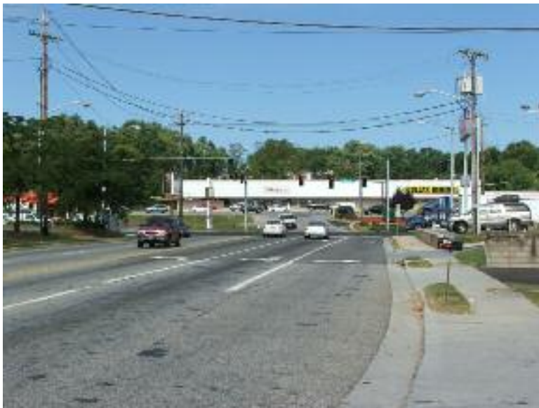
Figure 42-Travelers on Gus Nicks Boulevard may benefit by a US 460/221 and TO-81 signpost.

Finally, in regard to route markers, Gus Nicks Boulevard in the City of Roanoke is a popular route between Vinton, Route 24 and US460 (Orange Avenue). A route signboard on Gus Nicks Boulevard should show the US460/221 intersection and possible include a “TO I-81” sign (Figure 42)