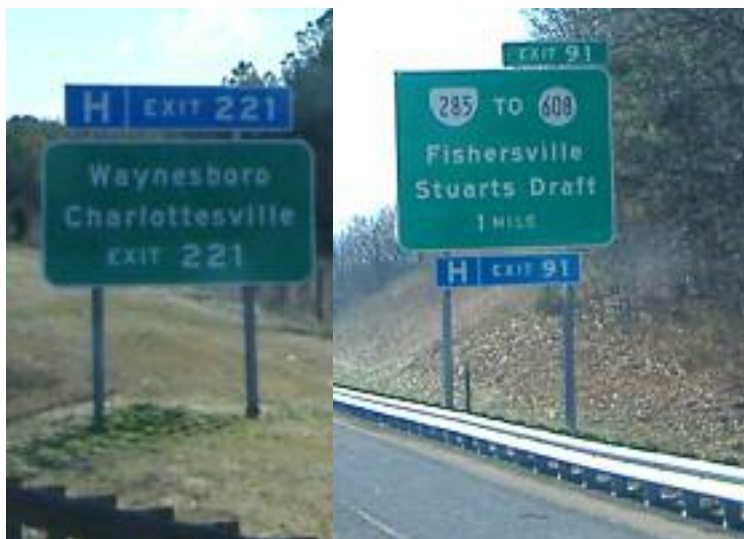
Figure 16-Hospital signs on I-81 and I-64 near Fishersville clearly indicate the Exit number for the Augusta County Medical Center. Signs in the Roanoke Valley could be updated to such standards.

After staff consulted with VDOT officials, the signs were modified by adding a small “next right” or “next left” sign under the “H”. Other areas of the state use even clearer markings such as Figure 16. When the Community Hospital closes in downtown Roanoke, Lewis Gale Hospital will probably be the closest hospital to serve the I-81 corridor. It is recommended that travel times be reviewed and that hospital signs be removed from Exit 143 ,if appropriate.