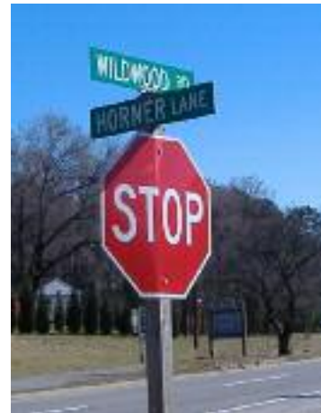
Figure 34-Street sign and stop sign on single post