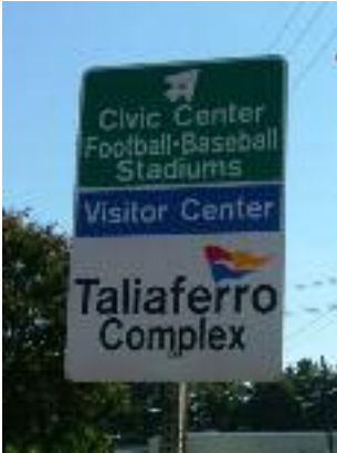
Figure 25-Font size of four inches is too small for traffic speed on Route 419. Where possible, all letters should be six inches tall.

According to the MUTCD standards: “ The principal legend on guide signs shall be in letters and numerals at least 150 mm (6 in) in height for all capital letters, or a combination of 150 mm (6 in) in height for upper-case letters with 113 mm (4.5 in) in height for lower-case letters. On low-volume roads (as defined in Section 5A.01 ), and on urban streets with speeds of 40 km/h (25 mph) or less, the principal legend shall be in letters at least 100 mm (4 in) in height. However, with an aging population, consideration should be given to making all type at least 6 inches in height.”