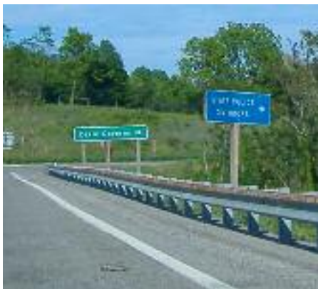
Figure 19-Clear directions on Interstate 81 north and Exit 132 ramp for the State Police Division Headquarters

On northbound Interstate 81, the State Police Division Headquarters has a sign for Exit 132. On southbound Interstate 81 the office can be found via Exit 137. Figure 19 shows clear directions from the northbound exit ramp at Exit 132. However, the driver reaches the intersection with US11/460 and has no indication whether to turn left or right (see Figure 20). Since this has possible safety implications (someone needing police assistance), a sign at the intersection of Dow Hollow Road and US/11/460 should indicate that a left turn is required. Since the office is several miles away, a distance measure may also be of value.