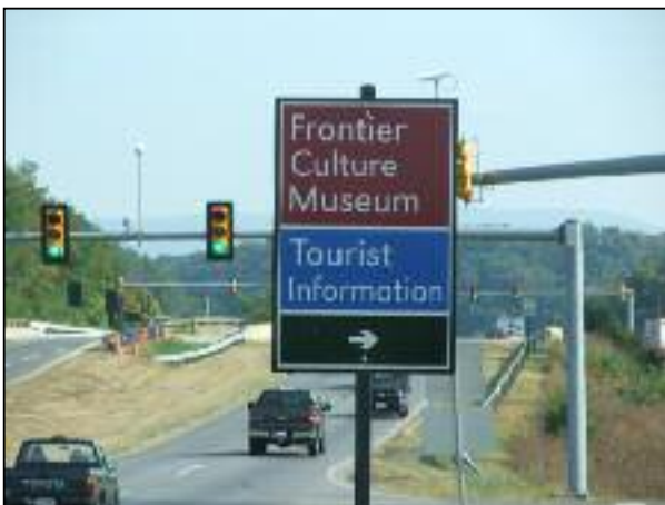
Figure 40- Wayfaring sign in the City of Staunton, VA