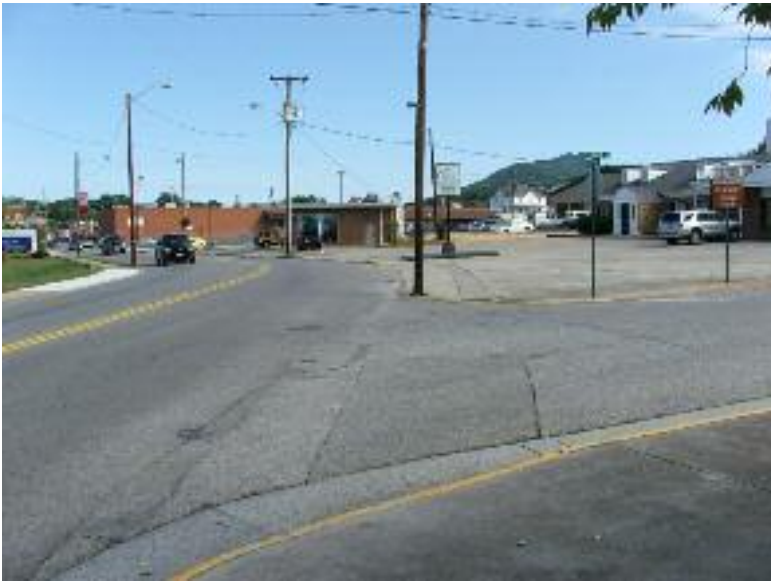
Figure 30-Another example of a sign placed in a poor location. The brown sign (on the right) should be placed closer to the through road on the left, and preferably before the turn.

There are also several instances of improper/incomplete stop sign placements in the Roanoke Valley. Figure 31 illustrates an example of a “T” intersection with incorrect stop sign placement. Adding to the potential confusion in the example below is the lack of a stop line on the pavement. While local drivers may be used to the traffic flow, visitors, inexperienced drivers or inattentive drivers may be looking in the wrong place for the stop sign. Figure 32 illustrates proper stop sign locations.